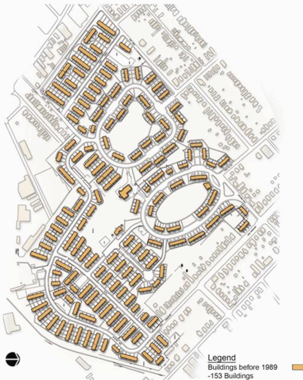
Site Plan Prior to 1989 Demolition